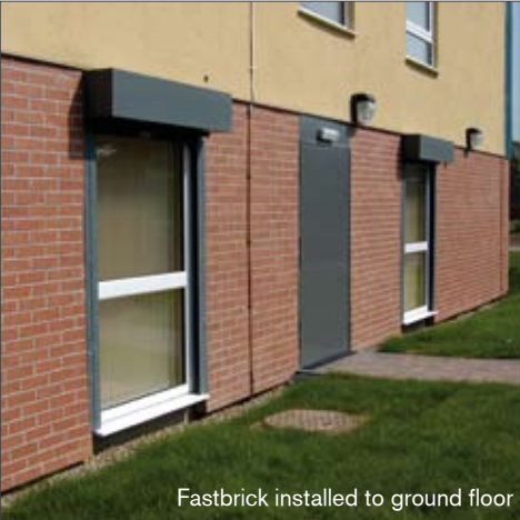
Fastbrick installed to ground floor

Client: Coast & Country Housing Ltd Building Type: No-Fines High Rise Project Size: 10 Storey 2500m 2 Product: • Structural Insulated Cladding & Render Finish • Fastbrick - Real Brick Slip Cladding to Ground Floor